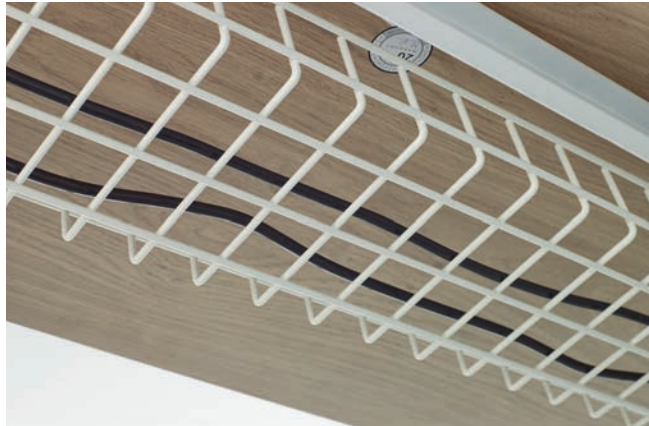
Wire basket (white)