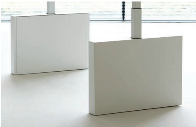
Optional: Cheek for Matrix