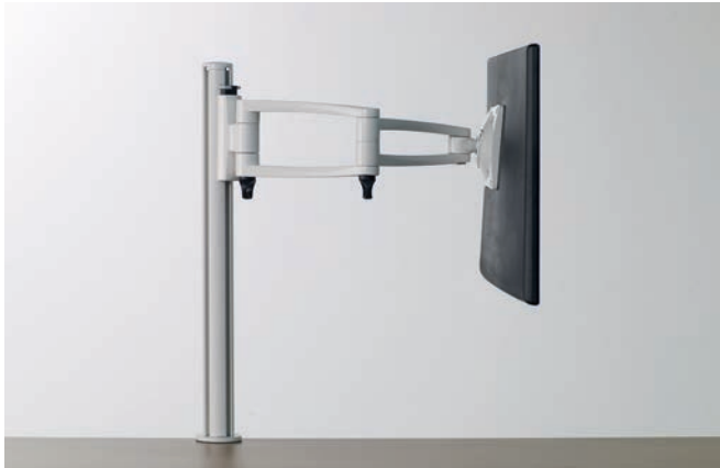
Q4 500mm Post + 1x ZOOM 102 (Incl. Zoom Arm)