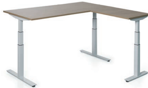
Matrix L shape return