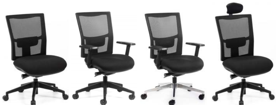
TEAM AIR EXECUTIVE

with optional multi-directional 3D arms.