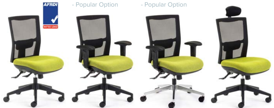
TEAM AIR HEAVY-DUTY