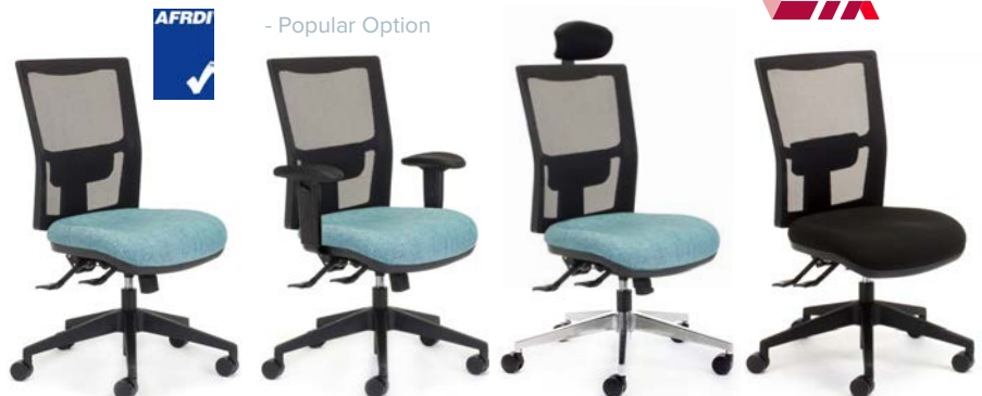
TEAM AIR TASK